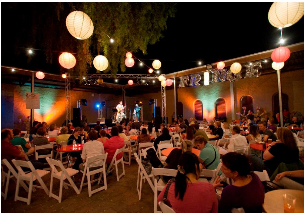
Desert Fringe in Port Augusta

Welcome and read on... your Fringe journey starts now!